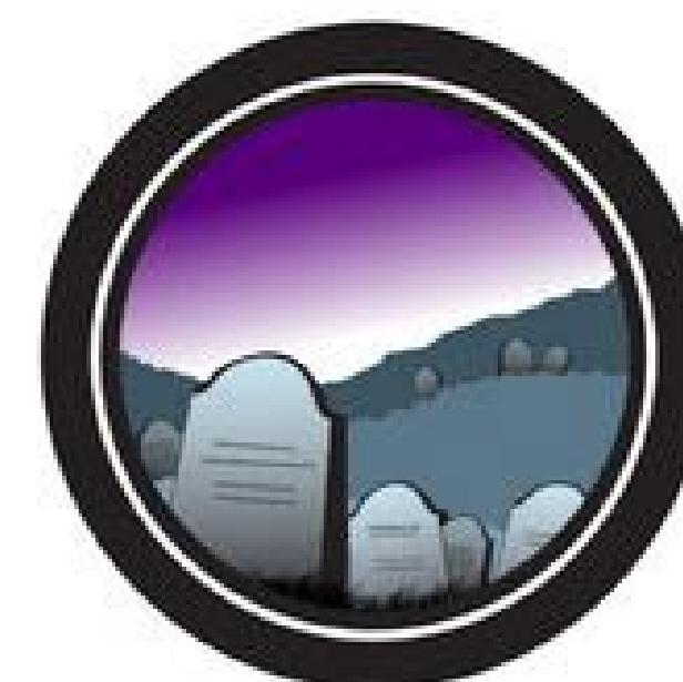
Death of First-Born Exodus 11:1-12:36