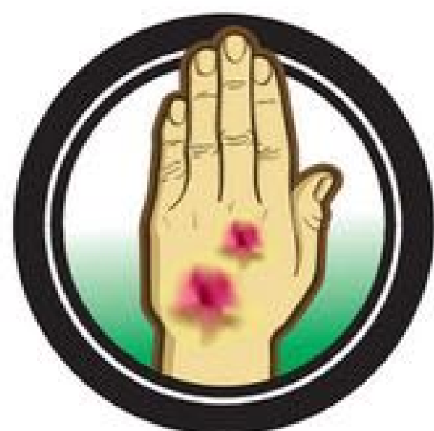
Unhealable Boils Exodus 9:8-12