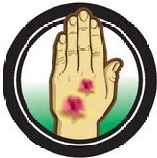
Unhealable Boils Exodus 9:8-12