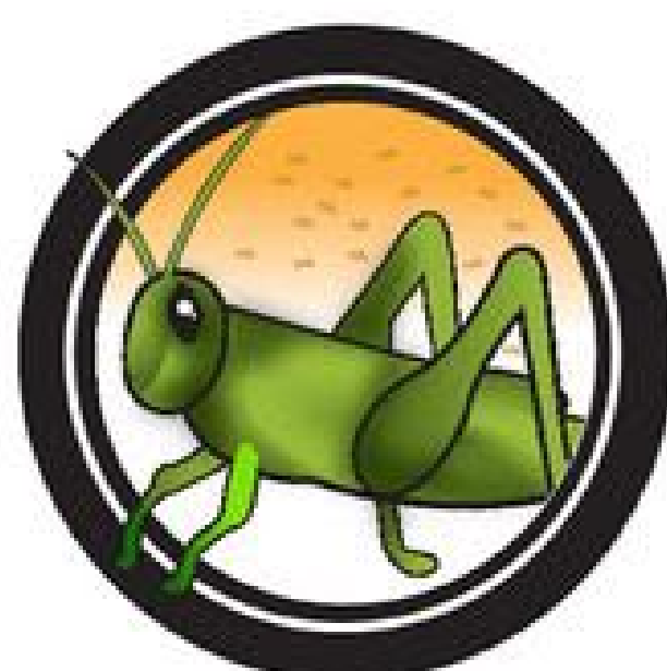
Locusts Exodus 10:1-20