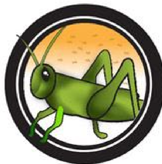
Locusts Exodus 10:1-20