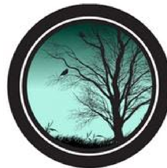
Darkness Exodus 10:21-29