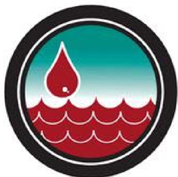
Waters Turn to Blood Exodus 7:14-25