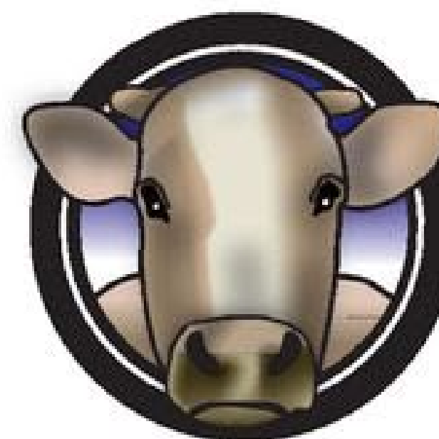
Disease on Livestock Exodus 9:1-7