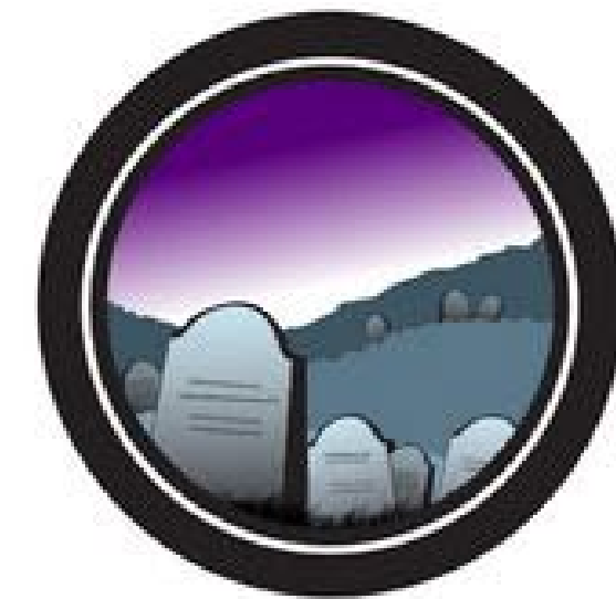
Death of First-Born Exodus 11:1-12:36