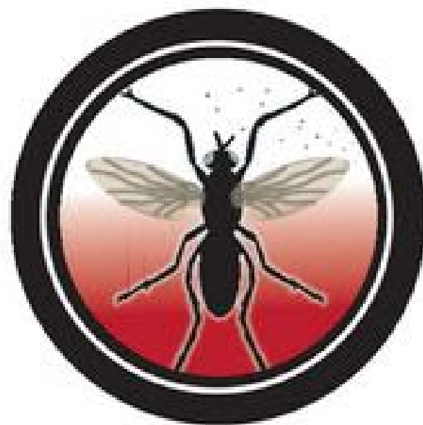
Gnats (Lice) Exodus 8:12-15