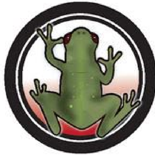
Amphibians (Frogs) Exodus 7:26-8:11