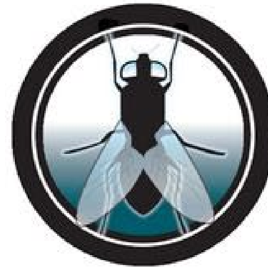
Flies Exodus 8:16-28